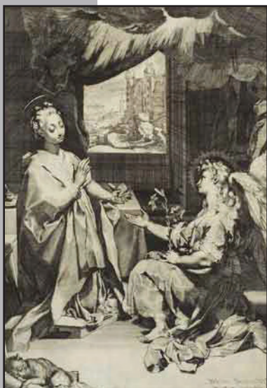
Federico Barocci, The Annunciation, c. 1584-88, from "The Early Modern Painter-Etcher"