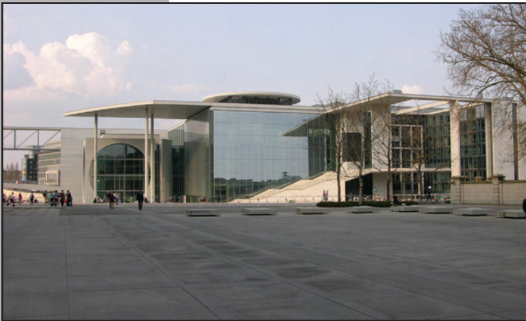
Marie-Elisabeth-Lüders-Haus, Berlin