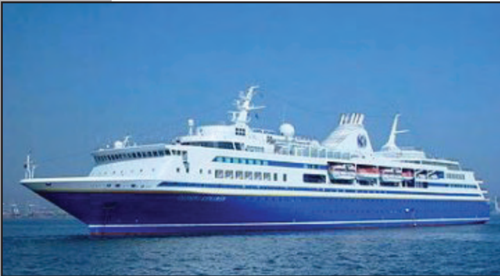
The Semester-at-Sea ship, M.V. Explorer