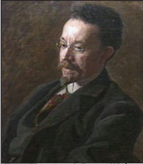
Thomas Eakins, Henry O. Tanner , 1897, from the Portraits of a People exhibition