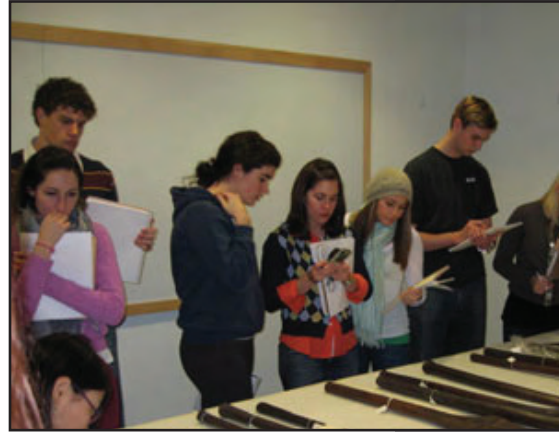
Students preparing materials for the "Trouble in Paradise" exhibition

the historiography of the period, methodological questions, and case studies of Romanesque masterpieces. Hard on its heels (October 28-29) followed "Representing History, 1000-1300: Art, Music, History" at Penn. This second conference, organized with support from Penn's Medieval Studies program and a number of other departments, brought art history and music into dialogue with historical studies to examine the realm of historical "representation."